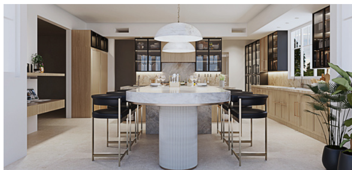
Custom kitchen island designed with local artist, Brentwood, CA.

As an interior designer, I am aware of the responsibility of being a designer and how my design choices influence the inhabitants of a given space. Intentional design considers the well-being and the enhanced purpose of the human experience. The leading principle of our work is not only to create spaces that are beautiful, comfortable, and functional; but, also, spaces that organically foster connections between people, where stories can be shared and inspiration is tangible.